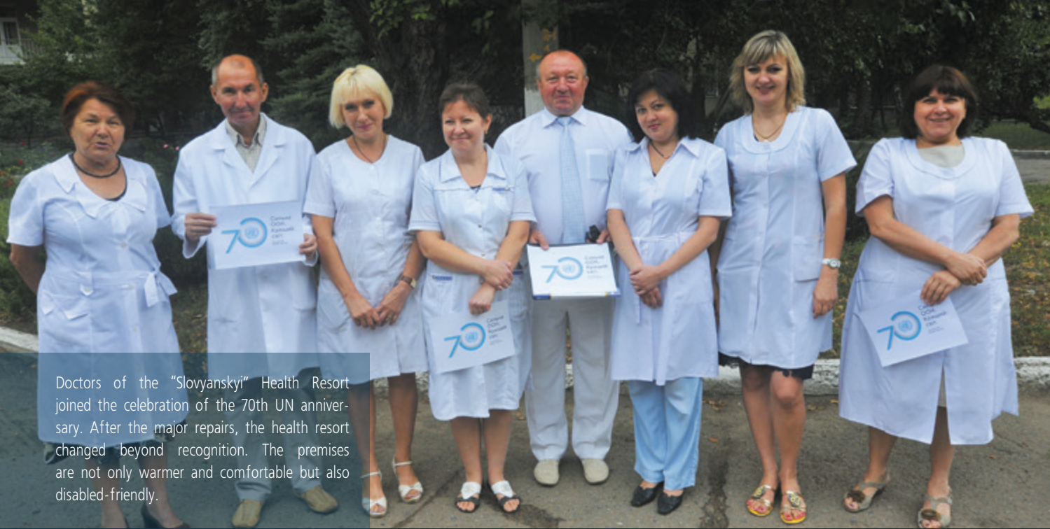
Doctors of the "Slovianskyi" Health Resort joined the celebration of the 70th UN anniversary. After the major repairs, the health resort changed beyond recognition. The premises are not only warmer and comfortable but also disabled-friendly.